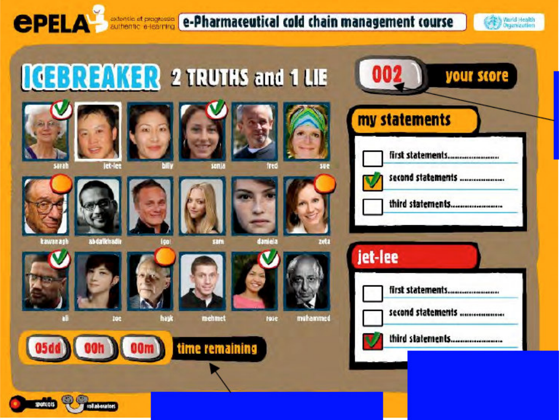
Figure 2. Example of a screen used as icebreaker to be used in the e-learning course.

Specific ideas identified in Table 1 were used by the developers in initial prototypes. For example, Figure 2 shows a sketch of an initial icebreaker activity, "Two truths and one lie" which aims to instantiate Draft Design Principle #2, Create safe structured and unstructured opportunities, methods, and tools for learners to meet, develop relationships, and actively collaborate with each other.